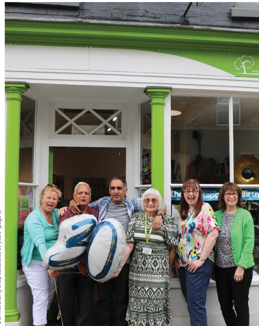
Our first charity shop celebrates 30 years (page 3)